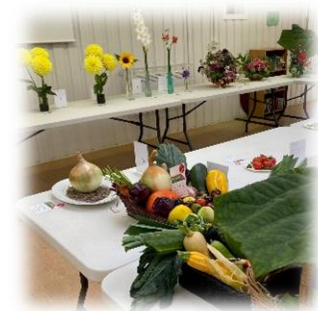
Stokes Wood Allotment Society, Horticultural Show 2023

The Rowley Fields Allotment Society are also holding an open day to mark the occasion. Why not hold your open day? There is support from me with publicity on our Facebook page and in the Gazette.