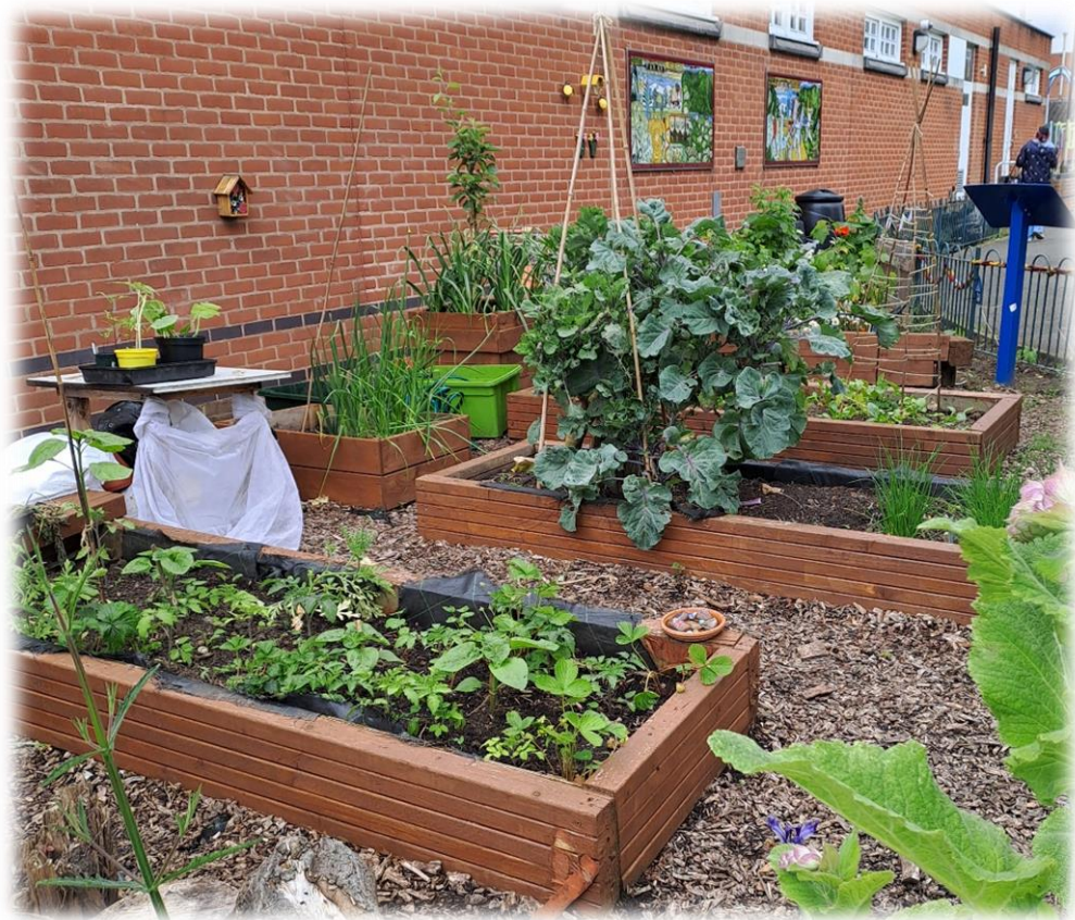
Belgrave Community Garden Project