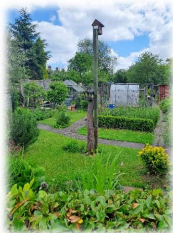
The delightful allotment plot 8.