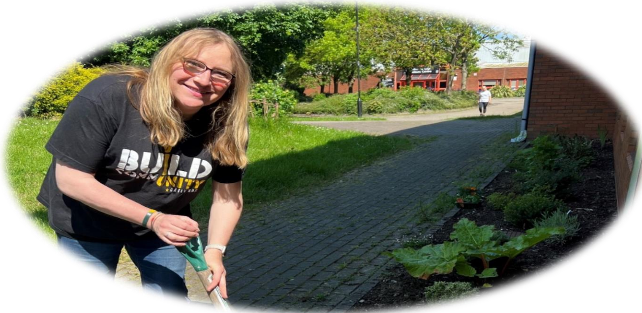
Looking after newly planted shrubs, runner beans, tomatoes and fruit trees at the Beaumont Leys Library.