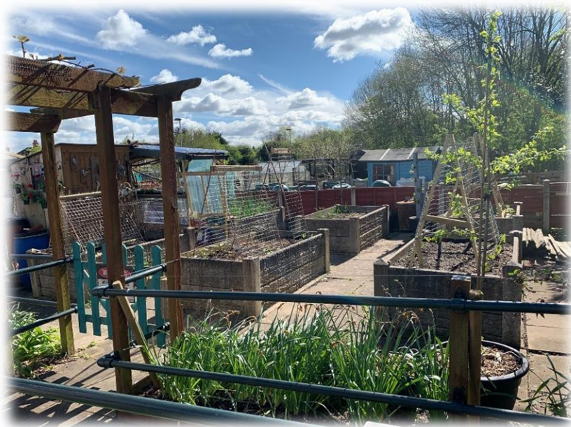
Easy gardening area at Stokes Wood Allotment.