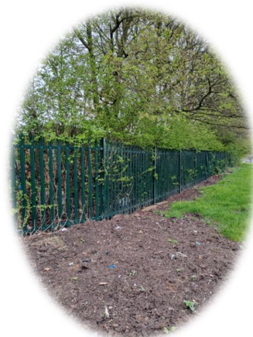
Reservoir Allotment perimeter fencing.

Details of a joint security workshop will be available soon.